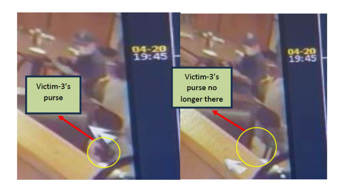
Figure 18 - Victim-3's purse pre and post offense.