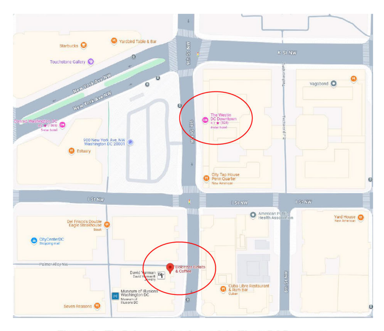
Figure 10 - The Dolcezza coffee shop and the Westin DC Downtown.

14. On or about April 21, 2025, USSS-UD disseminated a BOLO to MPD depicting the suspect involved in the April 20th robbery. In response to the BOLO, Officer Pearlman contacted USSS with an identification of the suspect, Officer Pearlman also provided information that appeared to connect the April 20th robbery to a series of offenses that had occurred in the District of Columbia.<sup>1</sup>