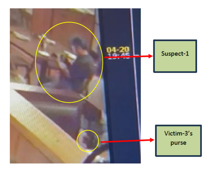
Figure 17 – BUSTAMANTE LEIVA along with the item determined to be Victim-3's purse.

30. Seconds later, BUSTAMANTE LEIVA twisted his body to his left towards Victim-3's purse and moved his left leg. Simultaneous to that movement, an object determined to be Victim-3's purse was seen moving out of camera view and in the direction of the suspect (between the 49 and 51 second mark of the aforementioned video). The video then captured the suspect bend down with his jacket in one hand and, with his other hand, pick up an object from the floor that law enforcement determined to be Victim-3's purse (beginning at the 1 minute and 3 second mark of the video). The entirety of the referenced video is in the possession of the Secret Service.