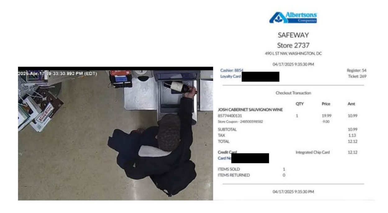
Figure 5 - BUSTAMANTE LEIVA making a purchase on April 17, 2025, at 9:35 PM using Victim-1's credit card.