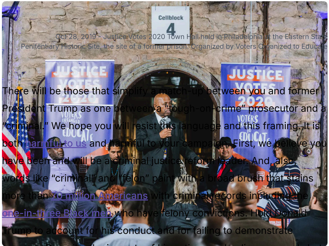
Oct 28, 2019 - Justice Votes 2020 Town Hall held in Philadelphia at the Eastern State Penitentiary Historic Site, the site of a former prison. Organized by Voters Organized to Educate

There will be those that simplify a match-up between you and former President Trump as one between a “tough-on-crime” prosecutor and a “criminal.” We hope you will resist this language and this framing. It is both harmful to us and harmful to your campaign. First, we believe you have been and will be a criminal justice reform leader. And, also words like “criminal” and “felon” paint with a broad brush that stains more than 70 million Americans with criminal records including the one-in-three Black men who have felony convictions. Hold Donald Trump to account for his conduct and for failing to demonstrate remorse. Describe the impacts of his actions and policy proposals but resist this outdated fear-mongering that reenforces the criminalization that locks so many of us out of voting, out of housing and jobs and freedom. This language dehumanizes us and opens the door to the ridicule and slander that has long plagued us since the Black Codes. Shouting “felon!” without acknowledging the injustices taking place daily in courts, prisons, and jails depresses the tremendous electoral potential of engaging with the tens of millions of us who have criminal convictions and the even greater number of American voters who love us.