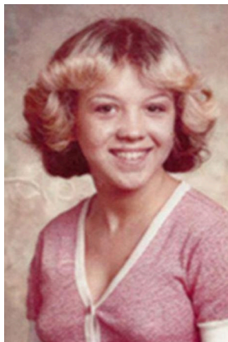
Photograph taken circa 1978

Murder Victim Caledonia, New York November 10, 1979