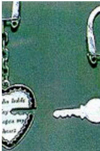
Two-piece locket keychain found on Alexander's body