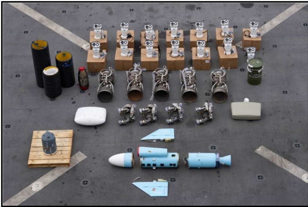
Suspected Iranian advanced conventional weaponry discovered on the dhow

23. The weaponry and warhead are shown in the photographs below. By way of reference, in the first picture, the warhead (located in the bottom left of the photo) is shown on top of a wooden pallet, which is approximately 3.5 feet by 4 feet.