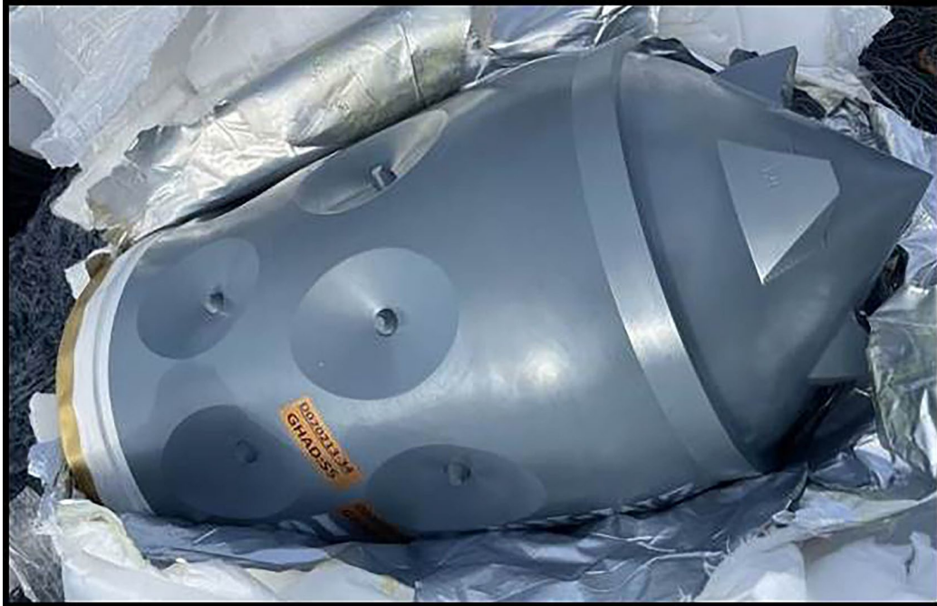
The warhead discovered on the dhow

24. In my training and experience, and that of defense personnel with whom I have interacted during the course of this investigation, and based on open-source reporting, I understand this type of weaponry to be consistent with weaponry used by the Houthi rebel forces in recent attacks on merchant ships and United States military ships in the region. Additionally, according to United States Central Command, “Initial analysis indicates these same weapons have been employed by the Houthis to threaten and attack innocent mariners on international merchant ships transiting in the Red Sea. This is the first seizure of lethal, Iranian-supplied advanced conventional weapons to the Houthis since the beginning of Houthi attacks against merchant ships in November 2023. The interdiction also constitutes the first seizure of advanced Iranian-manufactured ballistic missile and cruise missile components by the U.S. Navy since November 2019. The direct or indirect supply, sale, or transfer of weapons to the Houthis in Yemen violates U.N. Security Resolution 2216 and international law.”