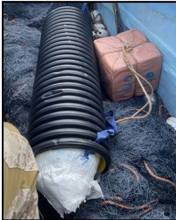
Suspected Iranian advanced conventional weaponry as discovered by Navy forces