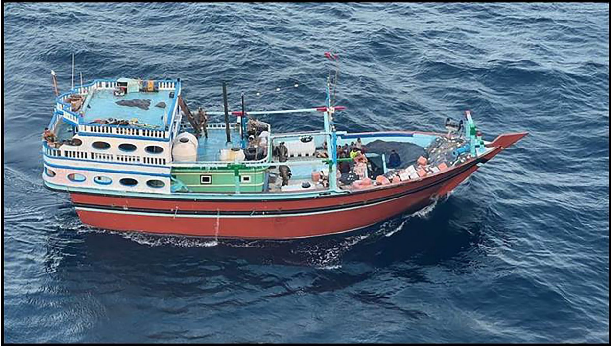
Dhow as of on or about January 11, 2024

20. Once on board, military personnel verified that the dhow did not, in fact, have any flag, in violation of international law. As a result, the dhow qualifies as a “vessel without nationality,” which is subject to the jurisdiction of the United States as that term is used in 18 U.S.C. § 2237. Similarly, because the dhow was operating in international waters, it qualifies as a “covered ship” and a “vessel without nationality,” which is subject to the jurisdiction of the United States as that term is used in 18 U.S.C. § 2280a.