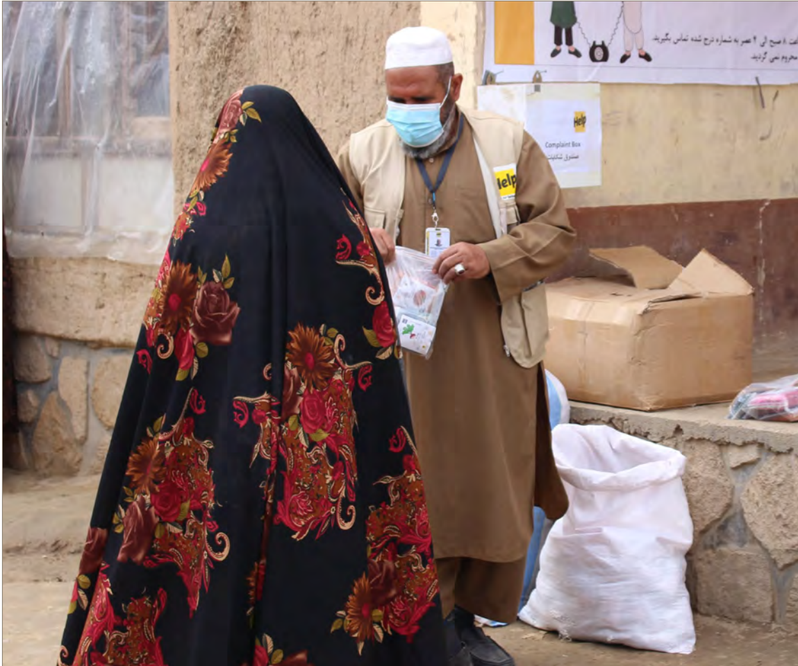
A man shares vegetable seeds with a woman in Badghis Province, to promote self-sufficiency and nutrition through home gardening