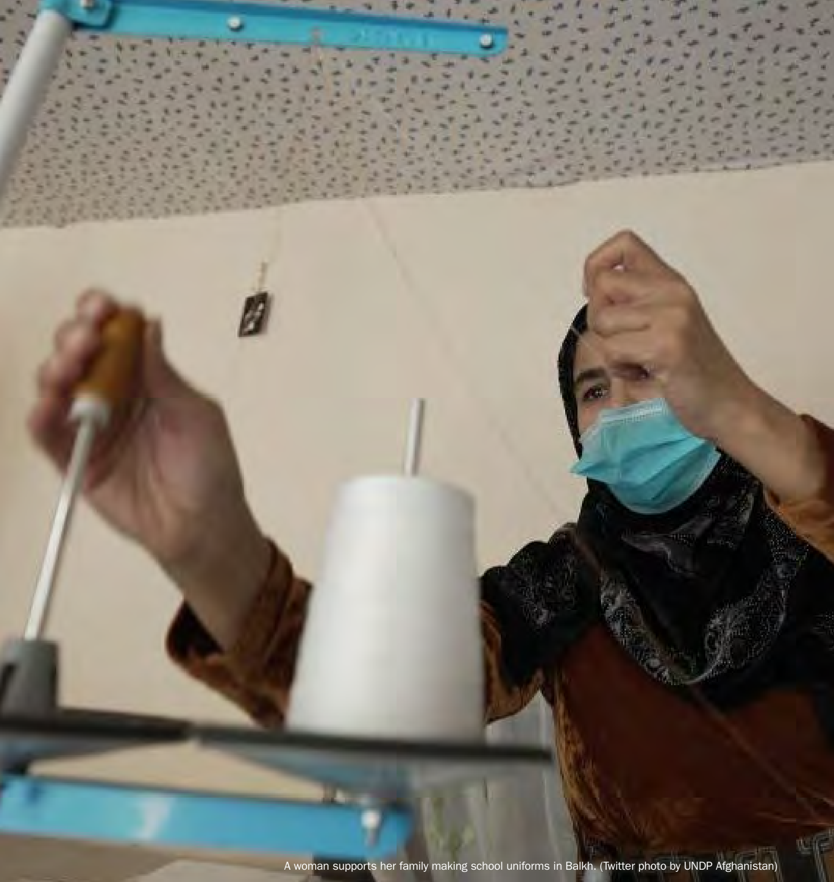
A woman supports her family making school uniforms in Balkh.