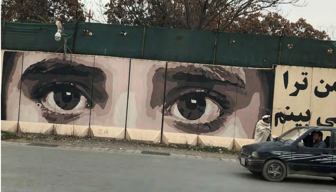
A propaganda mural on a street inside Kabul's Green Zone.