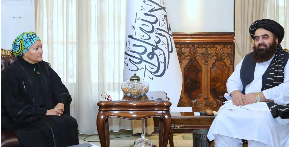
UN Deputy Secretary-General Amina Mohammed meets with the Taliban foreign minister, Amir Khan Muttaqi, in Kabul in January 2023 to discuss the Taliban restrictions on female employment with NGOs.

Afghan women from working for the UN. In response, the UN suspended operations for its 3,300 employees in the country, and on April 11 announced a pause and review of operations until May 5. According to UNAMA, “Through this ban, the Taliban de facto authorities seek to force the United Nations into having to make an appalling choice between staying and delivering in support of the Afghan people and standing by the norms and principles we are duty bound to uphold.” During the review period, UNAMA will continue to engage with the Taliban and accelerate contingency planning “for all possible outcomes.” While a UN withdrawal would have dire consequences for the Afghan people, UNAMA said in its statement: “It should be clear that any negative consequences of this crisis for the Afghan people will be the responsibility of the de facto authorities.” 24