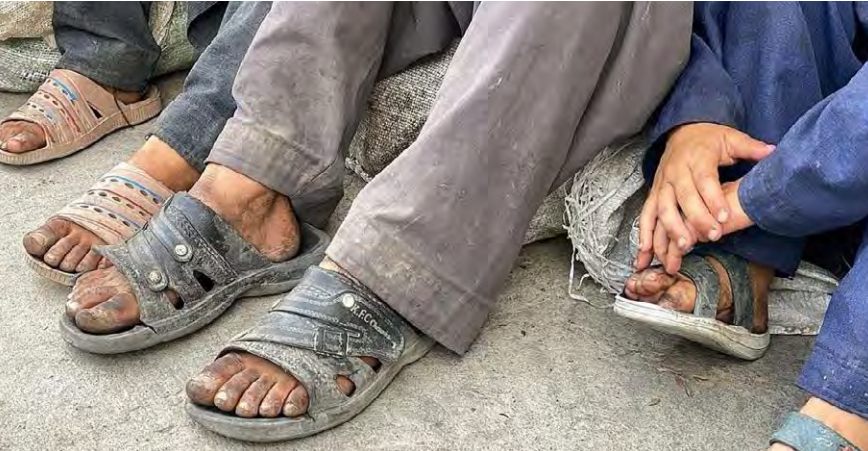
Displaced boys wait to receive aid in Kabul.

be used when making decisions about future funding. 54