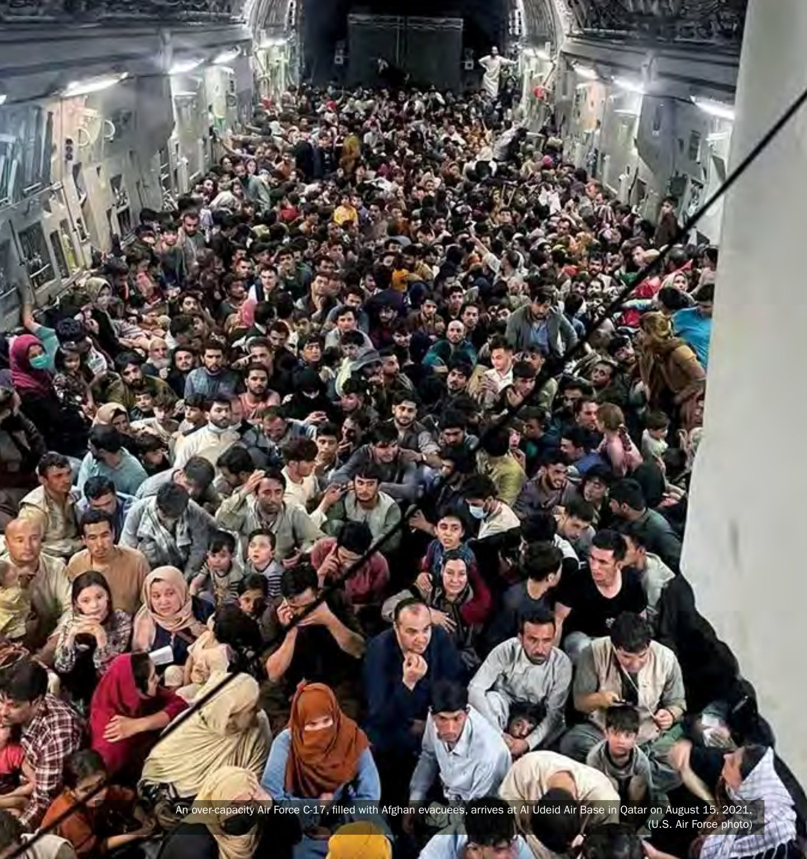
An over-capacity Air Force C-17, filled with Afghan evacuees, arrives at Al Udeid Air Base in Qatar on August 15, 2021.