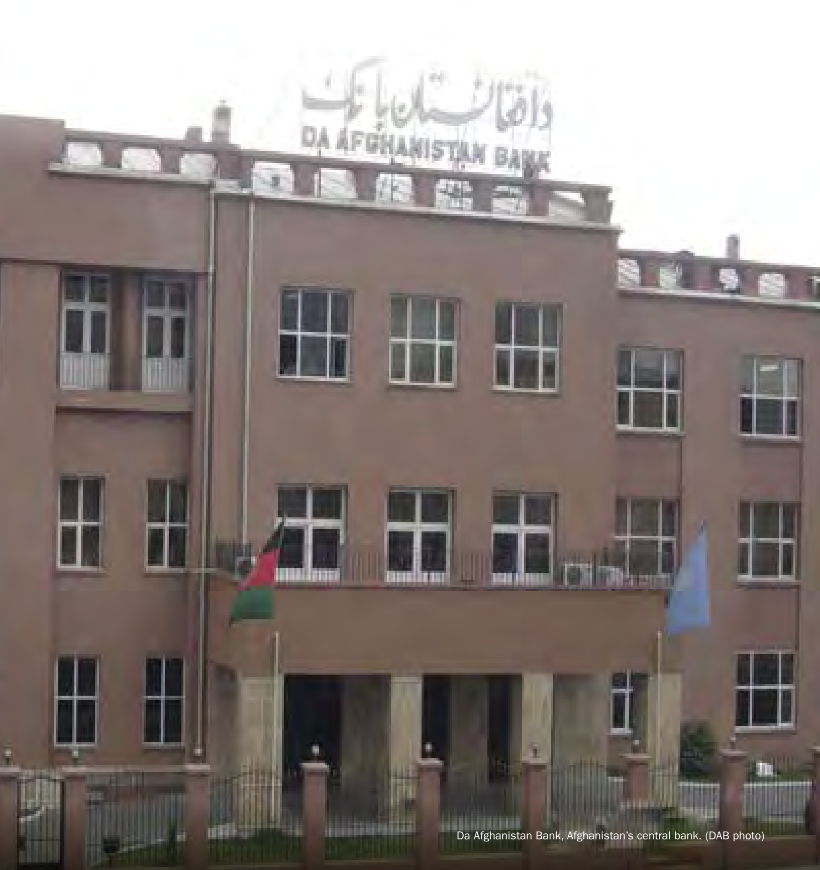
Da Afghanistan Bank, Afghanistan's central bank.