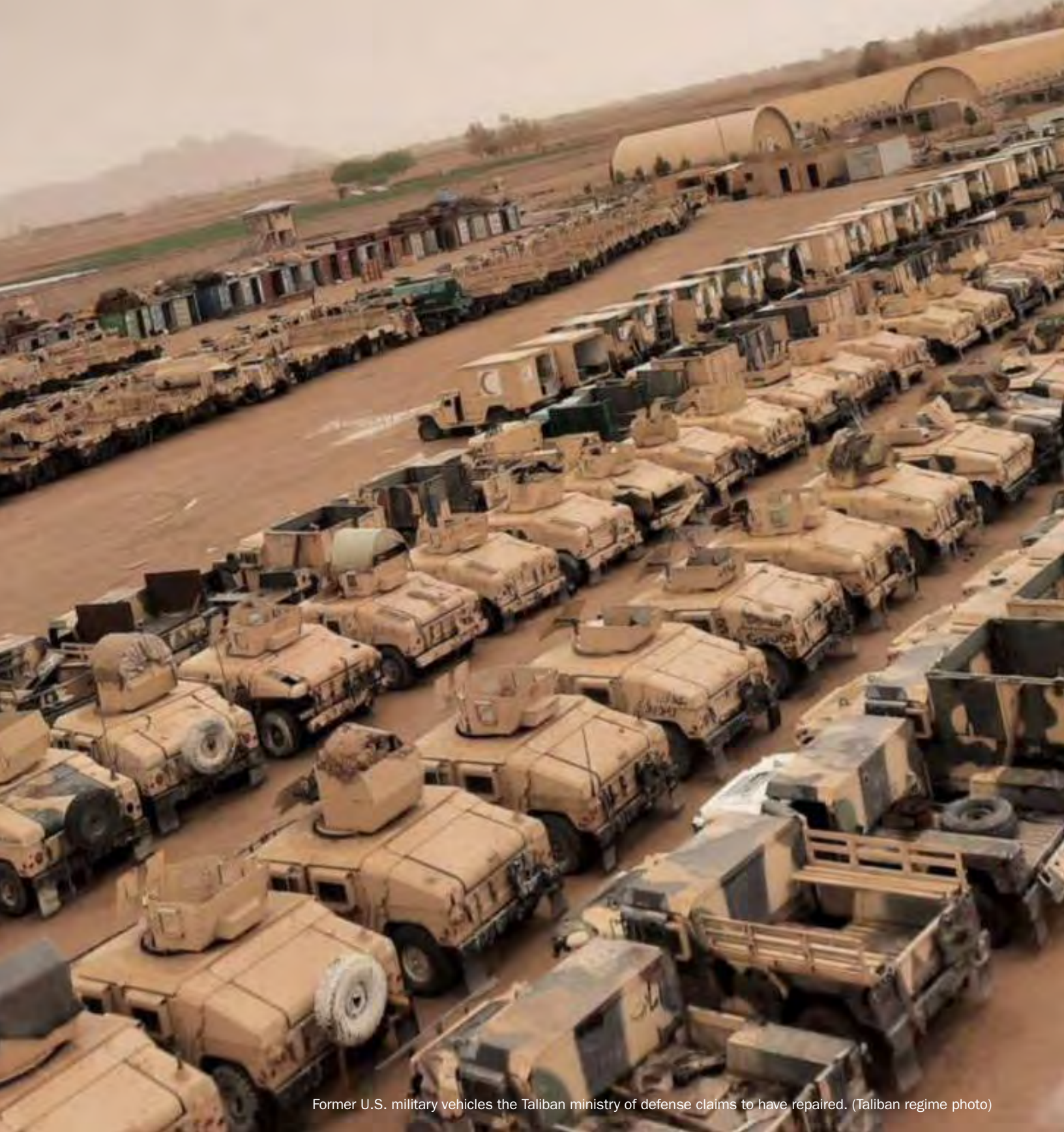
Former U.S. military vehicles the Taliban ministry of defense claims to have repaired.