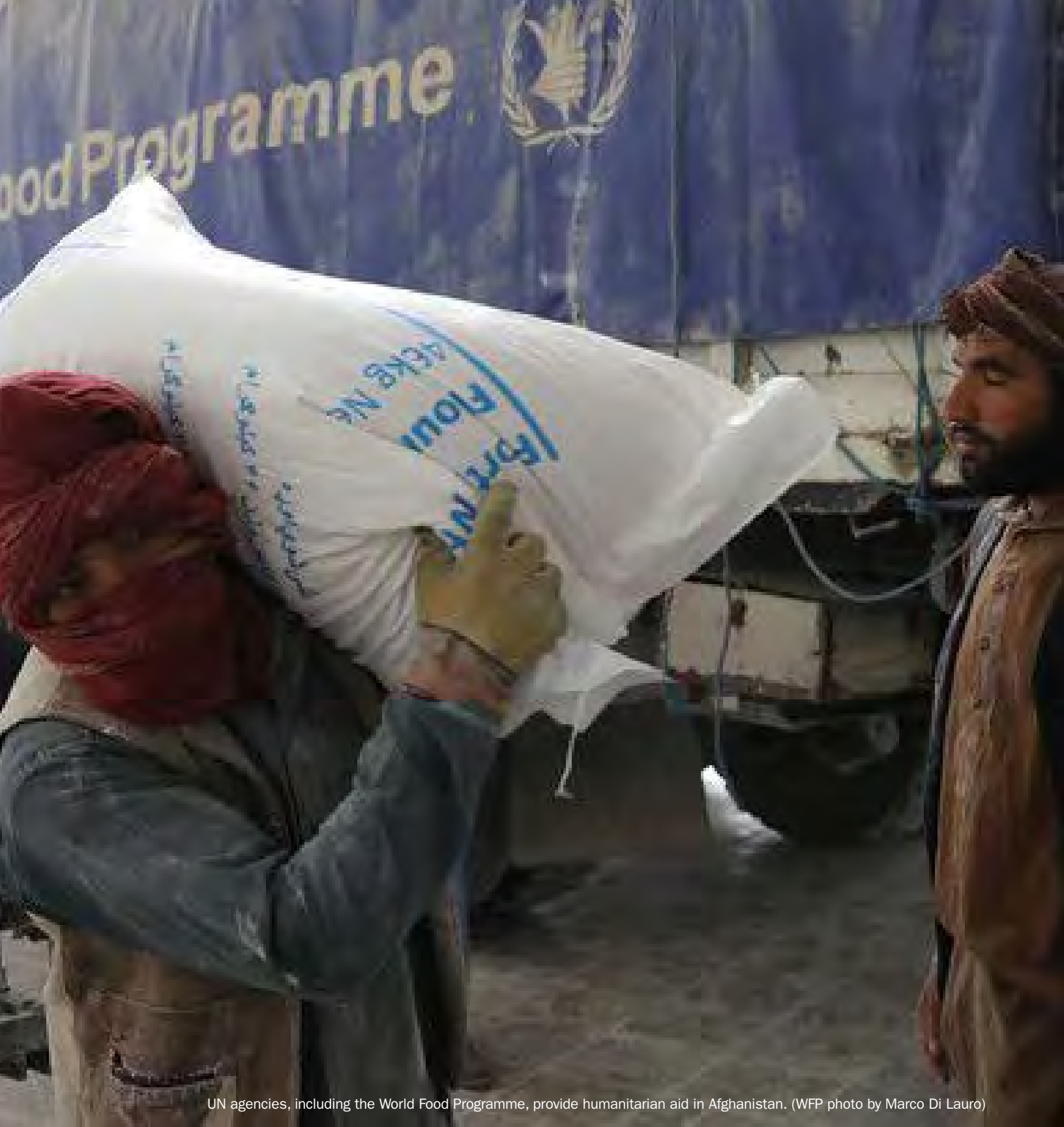
UN agencies, including the World Food Programme, provide humanitarian aid in Afghanistan.