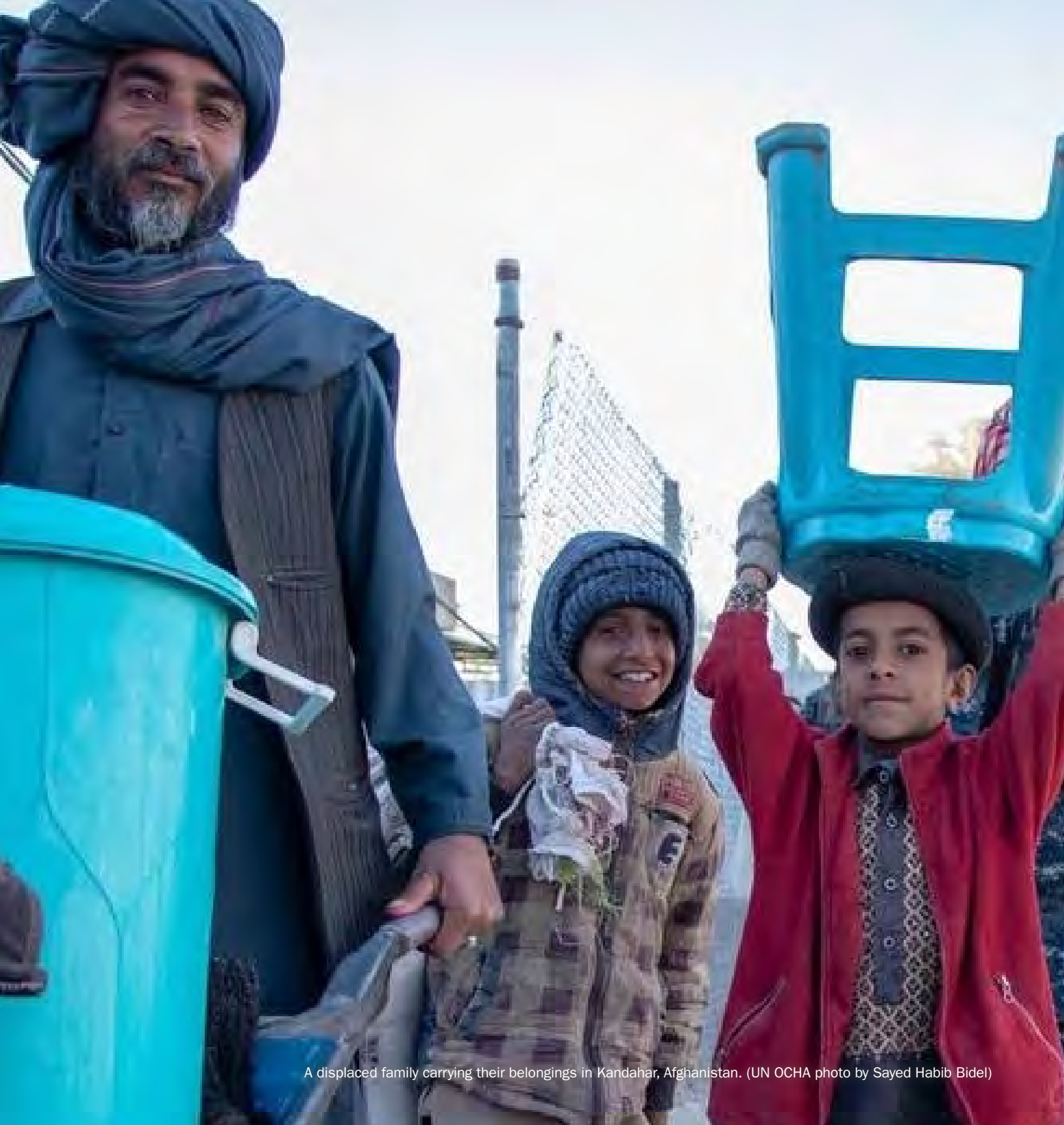
A displaced family carrying their belongings in Kandahar, Afghanistan.