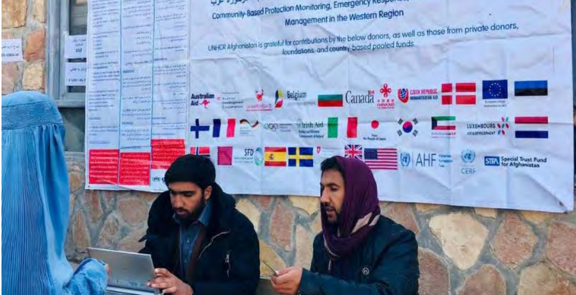
UN workers provide cash assistance to over 570 families in Badghis Province.