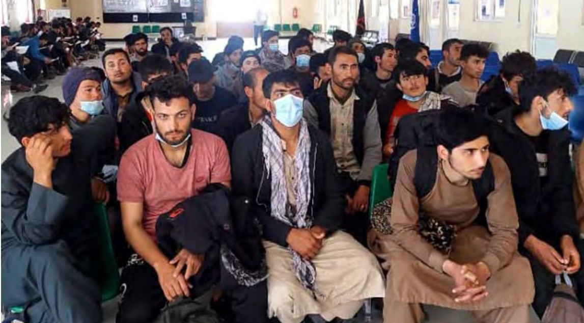
Afghan refugees await processing after returning from Iran.

to gain admission to the U.S. is as wives or daughters.” 168