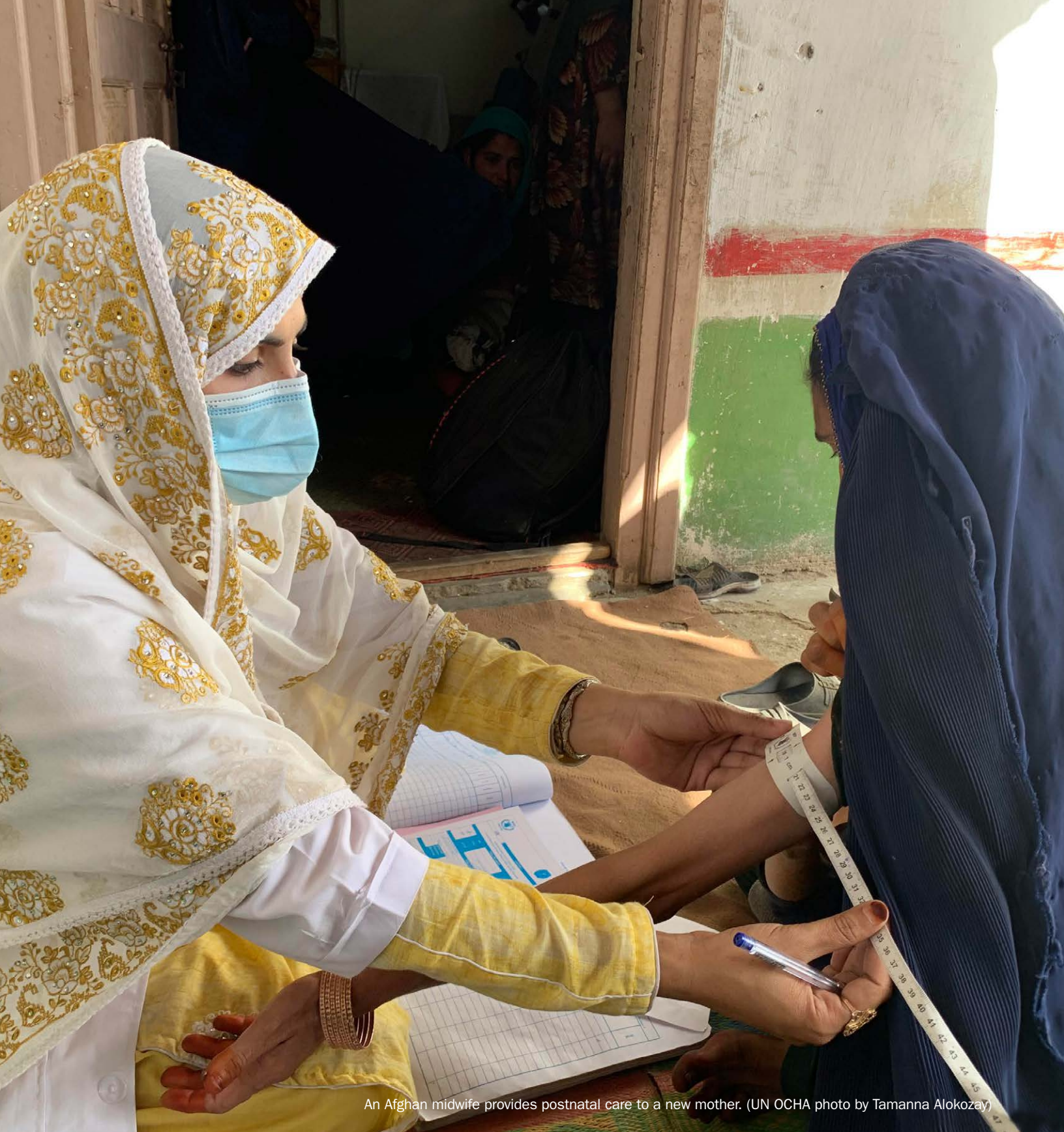
An Afghan midwife provides postnatal care to a new mother.